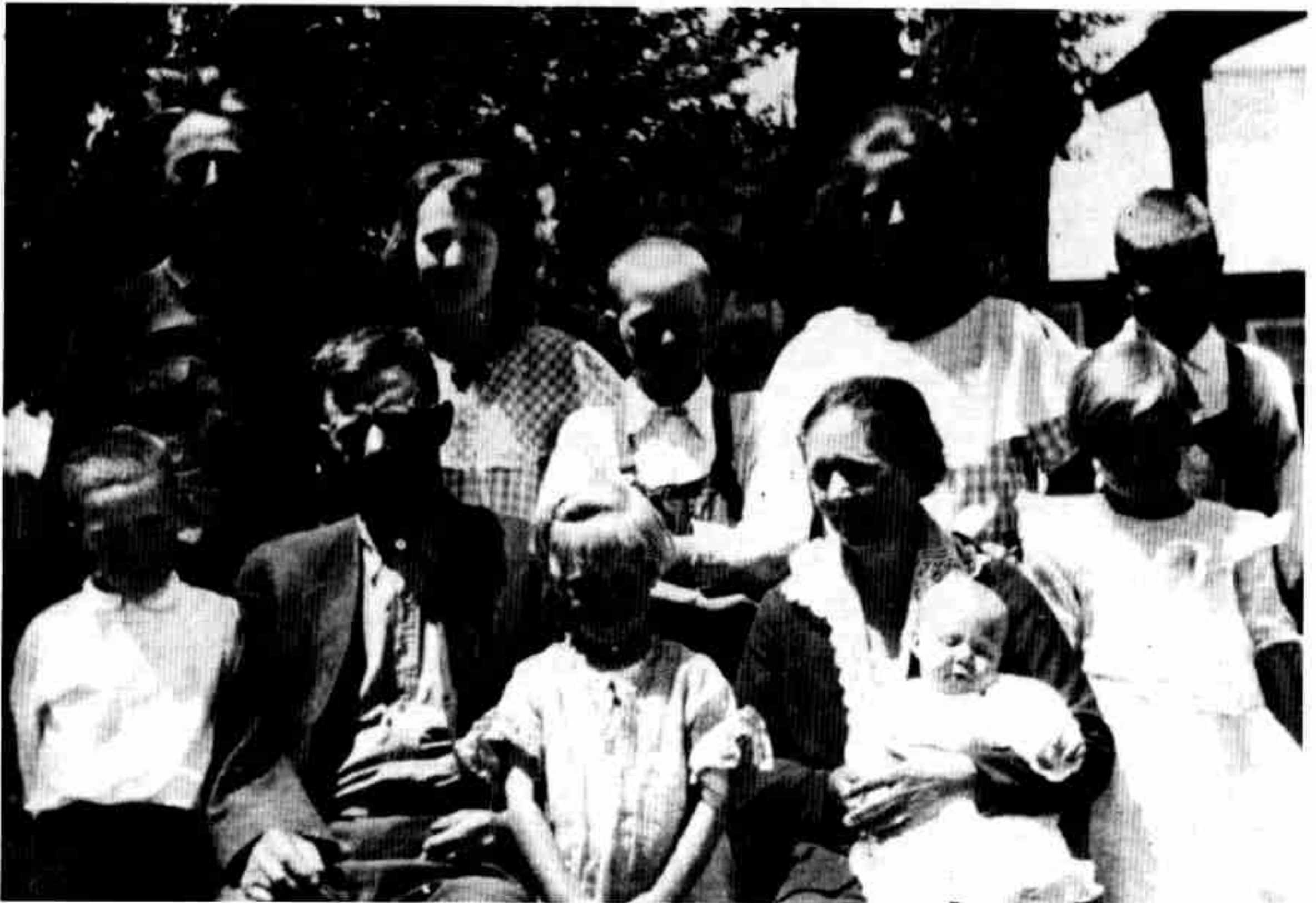
The family in 1925

Besides farming, Father operated sheepshearing and dipping corral. My mother cooked for the shearers and other men employed at the corral. About 1899 the sulphur works opened up in the south side of the valley of Wood Canyon and mother boarded the men that worked at the sulphur works. She boarded these men for three summers, having as many as 75 to 100 for a meal. I and two hired girls helped mother with all this work. I was kept plenty busy, but learned much that helped me later in life.