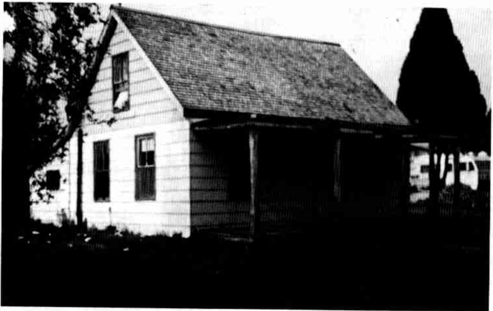
Their first home in Soda Springs, built in 1887 or 1888.